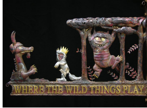
Where the Wild Things Play