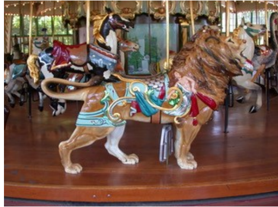
Dentzel Lion