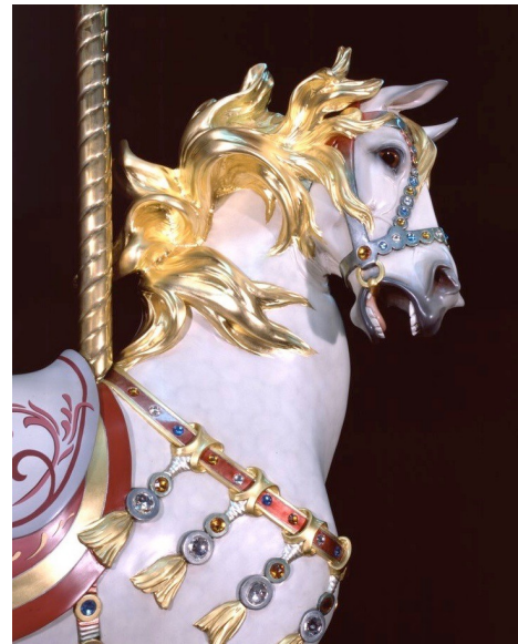
Ilions Supreme Carousel Wooden Horse

right: Ilions Supreme Carousel - Wooden Horse ca. 1927, 23k gold leaf, white gold leaf, mixed media. Restoration by Lise Liepman.