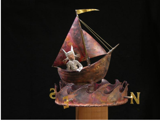
Max from Where The Wild Things Are