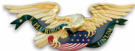
Chesapeake Eagle - photo JP Uranker Woodcarver